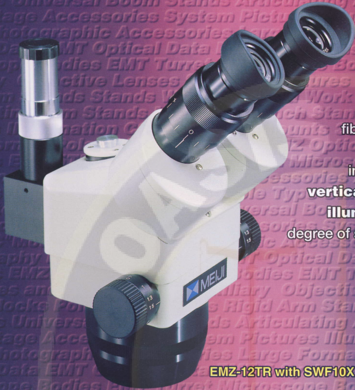
EMZ-12TR with SWF10X