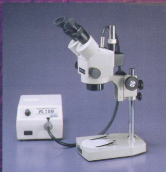
EMZ-12TR with SWF10X, PX stand, FL150 and FL150/12