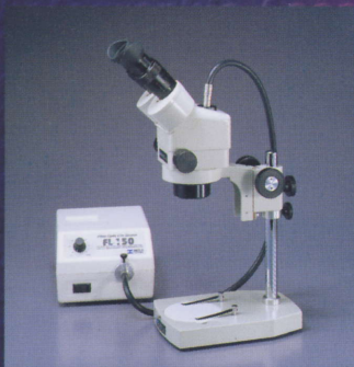
EMZ-12 with SWF10X, PX stand, FL150 and FL150/12

The EMZ-12 and EMZ-12TR offer a 6.2:1 zoom ratio and provide magnifications from 2.8X to 75X with optional eyepieces and auxiliary lenses. The EMZ-12 Series utilizes the FL150/100 or FL150/200 fiber optic light source in conjunction with the FL150/12 specially designed fiber optic light pipe to achieve superior cool light illumination over an exceptionally large field of view. (Note: The FL150 Series components must be ordered individually.)