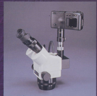
EMZ-12TR with SWF10X, MA151/35/50 and NIKON® Coolpix® 950