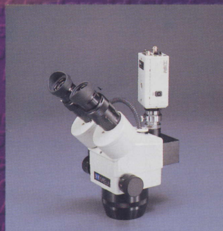
EMZ-12TR with SWF10X, MA151/8TR and CK3900